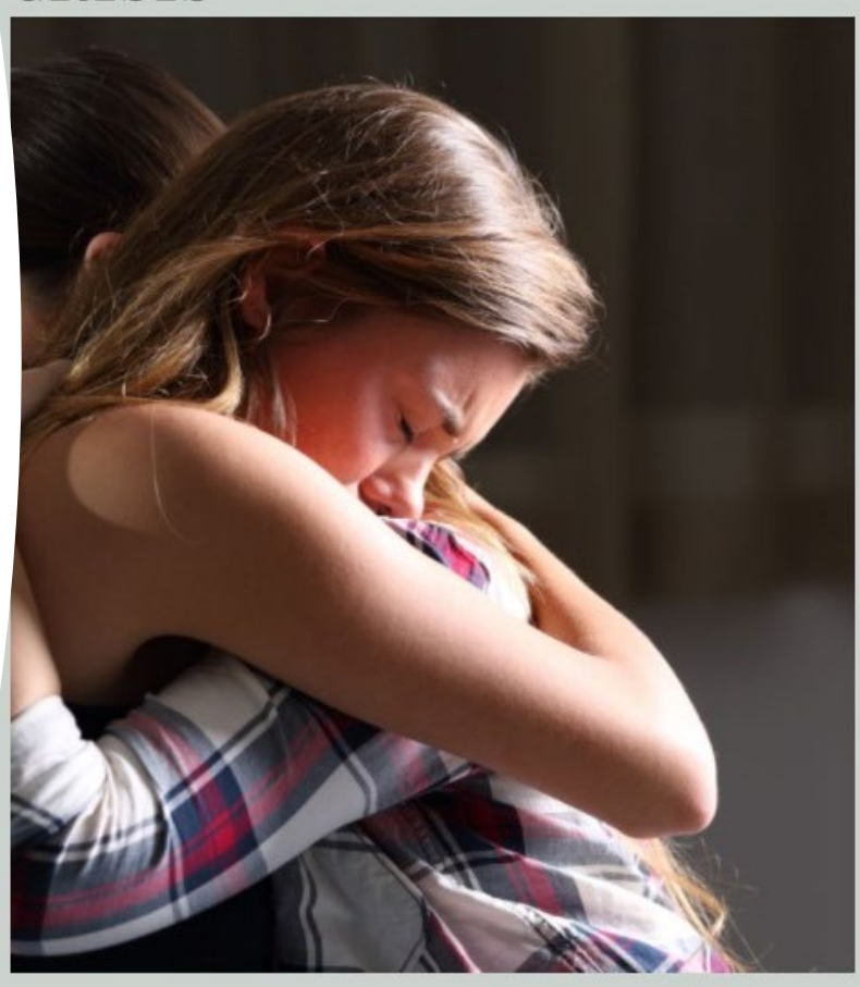
PROVIDING SUPPORT DURING DIFFICULT TIMES